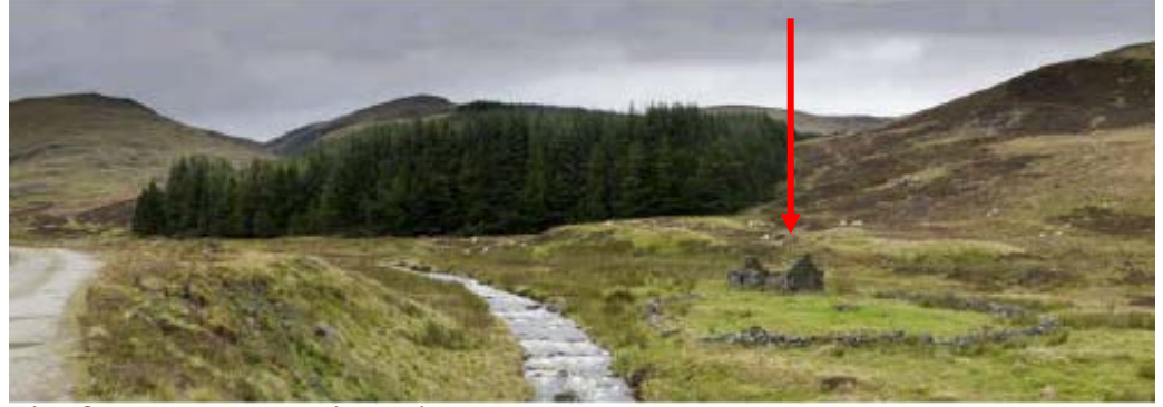
Fig. 2 - Photo showing Kilbo Bothy context

I. The application site is located in a remote upland area at the head of Glen Prosen, at the confluence of the Prosen Water and the Burn of Kilbo. It comprises the stone ruins of a bothy known as the Kilbo Bothy and a sheep enclosure (see Fig. 2). The site is close by to an existing conifer plantation while the remainder of the adjacent area is rough open moorland. The River South Esk is nearby and is a designated Special Area of Conservation (SAC).