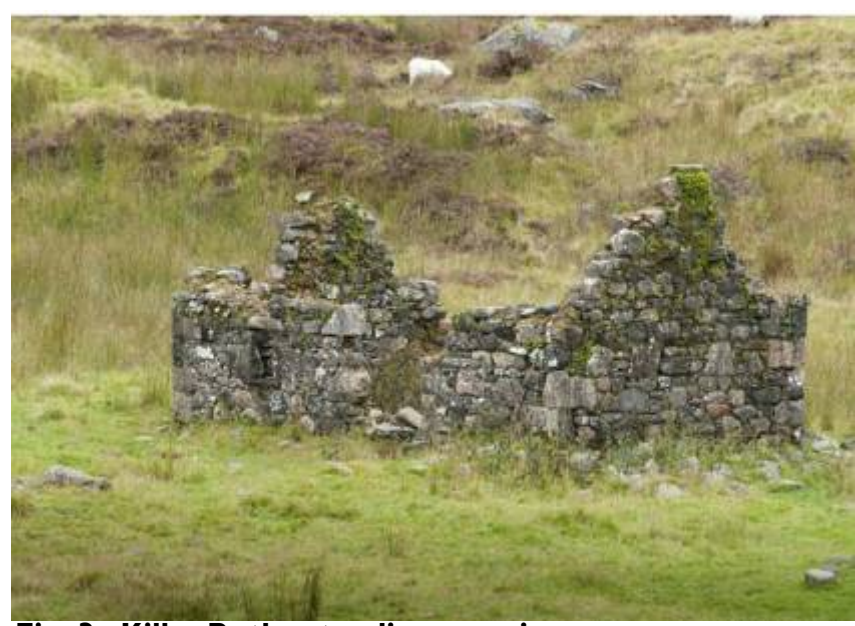
Fig. 3- Kilbo Bothy standing remains